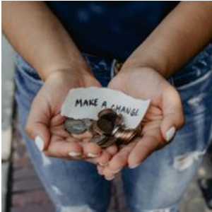
DRIVEN BY YOUR CAUSE