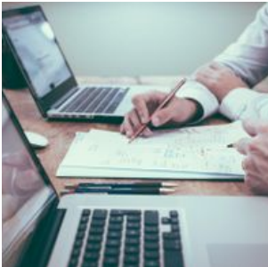
THE MOST ADVANCED PROSPECT RESEARCH THAT EXISTS