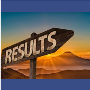
RESULTS FOR OUR CLIENTS