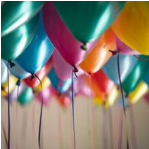
CELEBRATING 25 YEARS